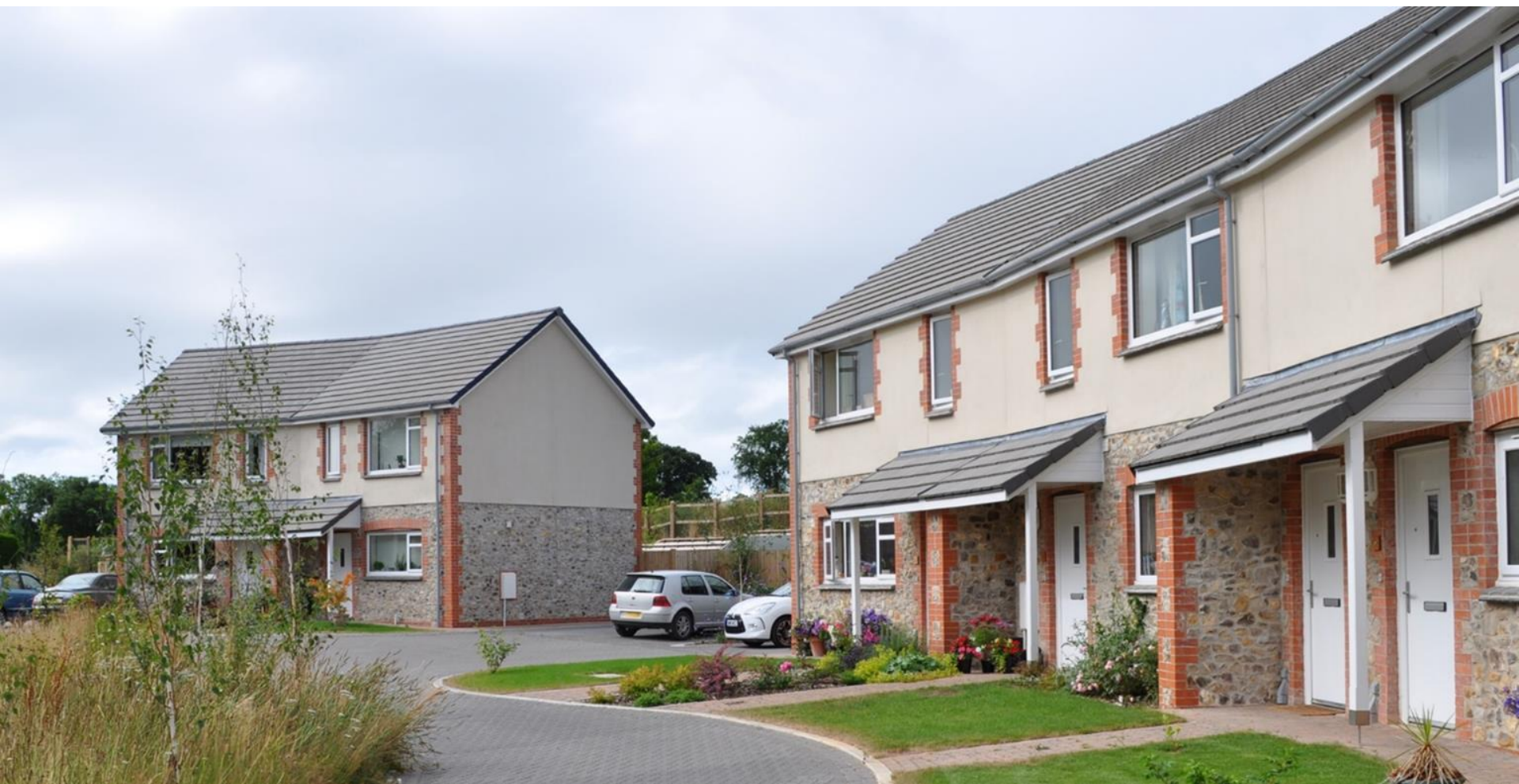
East Devon Corry Valley CLT – 6 homes